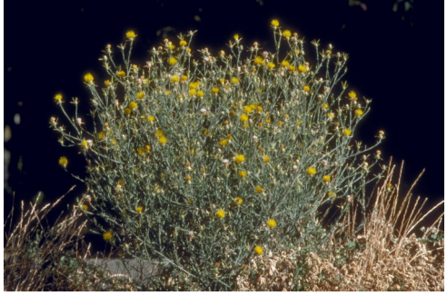
ABOVE: Yellow starthistle BELOW: Yellow starthistle close-up